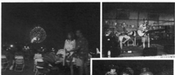
4th of July 2004 we had a potluck cook-out in conjunction with Bay Air and EAA Chapter 47, with live music, clowns and other kids' activities, and a great view of the City's fireworks.