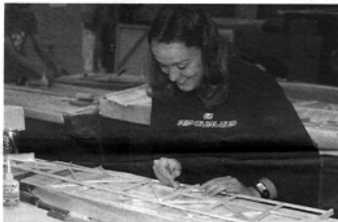
Boca Ciega HS student builds a model wing as part of the Aviation & Aerospace curriculum. AWAPS provides students actual flights to test the accuracy of the flight simulation they create in the two-year coursework.