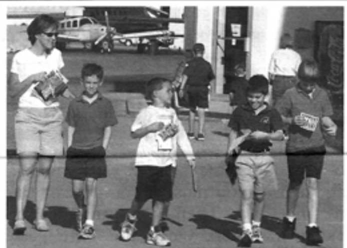
Albert Whitted has something for everyone! These Young Eagles are still aloft after their flight experience.