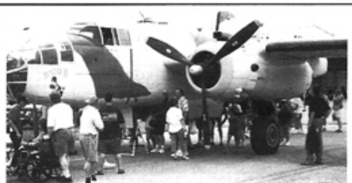
The 2003 airshow at Albert Whitted commemorated our airport's 75th Anniversary.

AWAPS founding members at the initial meeting, early May 2003: