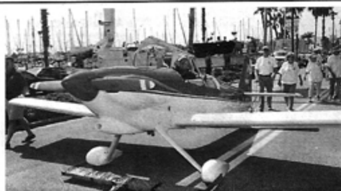
AWAPS' historic "flight" down the city streets of St. Pete in the 2004 Festival of States Parade in April.