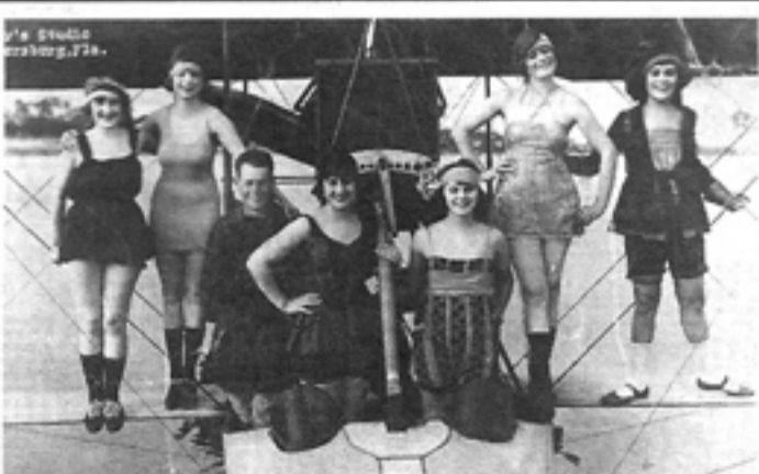
Who's the fellow surrounded by lovely St. Petersburg bathing beauties in this vintage photo? The first 10 callers to the AWAPS office at 727-822-1532 with the correct answer will receive an aviation poster. Just leave a message including your name and phone number so we can contact you.