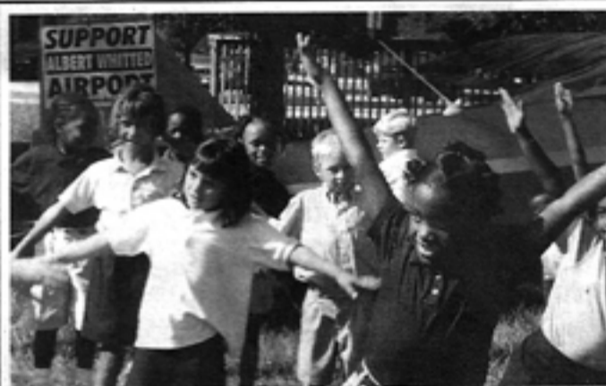
Kids learn about aerodynamics playing "Be the Wings" when The Spirit of St. Pete visits Fairmount Park Elementary School.