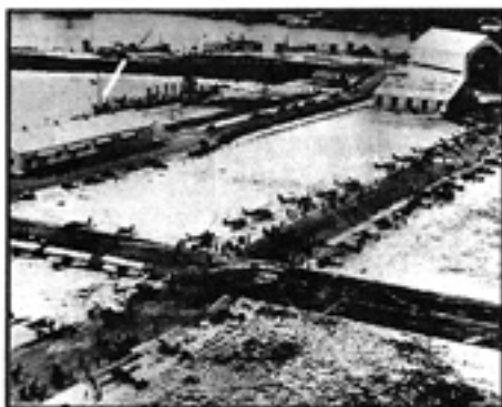
This is an airshow in 1933 with the blimp hangar at upper right.