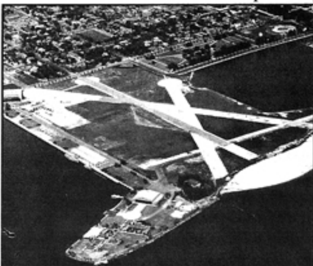
Early aerial photo of the airport with the blimp hangar at upper left.