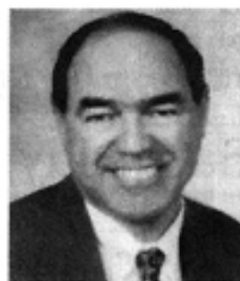
"Selling St. Pete Since 1970"

Please update your email and postal address at awapsoffice@albertwhittedairport.org