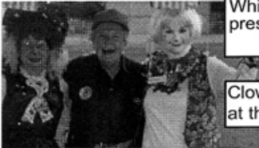
Clowning around at the AirFest