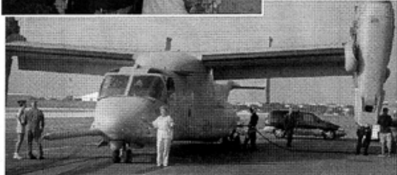
The Osprey was a big hit at Suncoast AirFest 2005

Come See Santa arrive at Albert Whitted Airport by Helicopter & enjoy a special Holiday Lunch!