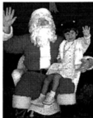
Santa and a friend at 2004 Spaghetti Lunch.

Thanks to sponsors West Florida Helicopters, Orange Blossom Catering, Chick-fil-A and Spartan Italian Restaurant!